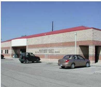
Malcolm Purvis Library 510 Melton Street Magnolia, Texas 77354