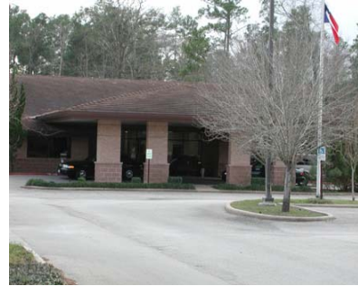
South County Community Building 2235 Lake Robbins Drive The Woodlands, Texas 77380