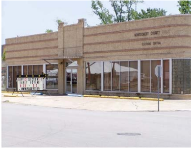
Election Central 225 Collins Street Conroe, Texas 77301