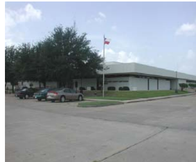
East County Courthouse Annex 21130 U.S. Highway 59 South New Caney, Texas 77357

Early Voting and Election Day Site for City of Magnolia Election